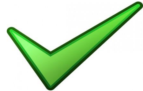
Stack Overflow Answer Code Fragment

while (position < size) { long count = inChannel.transferTo(position, maxCount, outChannel); if (count > 0) { position += count; maxCount -= count; } }