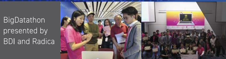
BigDatathon presented by BDI and Radica