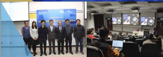
Monthly Lecture Series with Cross Disciplinary Speakers