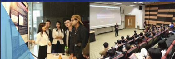
University Fintech Education Forum