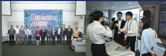
Big Data and AI Day 2017