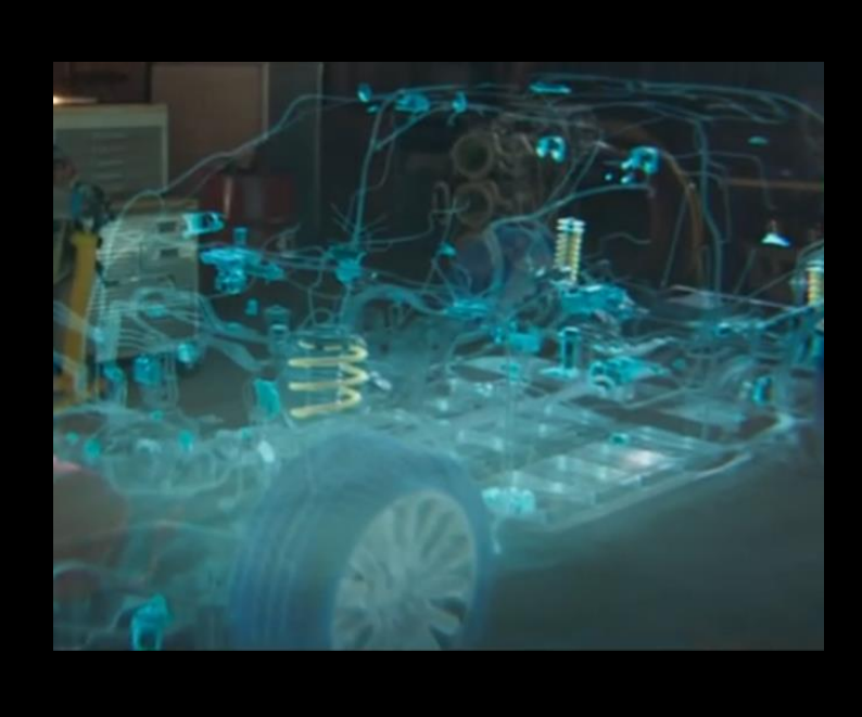
Visualize our designs

Promising application scenarios in the post pandemic world!