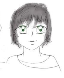
The Representaives of Euterpe, Apollo, Lorelei and Couril