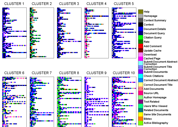
Figure 1. User Clusters Generated by the 10-Component Markov Mixture Model.

value. For cluster visualization we chose 100 sample user sessions randomly from each cluster. Each unique action is represented by a unique color (action-color mapping is also shown in the figure). Hence, each user session is represented as a row of colored squares, where each squares corresponds to an action.