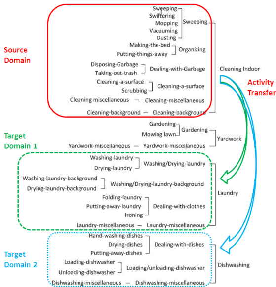
Figure 1. An example of cross-domain activity recognition.

other categories’ activities (e.g. in “Laundry”, “Dishwashing”). So in our problem, we have a source domain of activities that has the labeled sensor data from activities in the “Cleaning Indoor” category. We also have some target domain that has the unlabeled sensor data from the activities in some other category such as “Laundry” (denoted as “Target Domain 1”) or “Dishwashing” (denoted as “Target Domain 2”). Then, we ask the following fundamental questions: